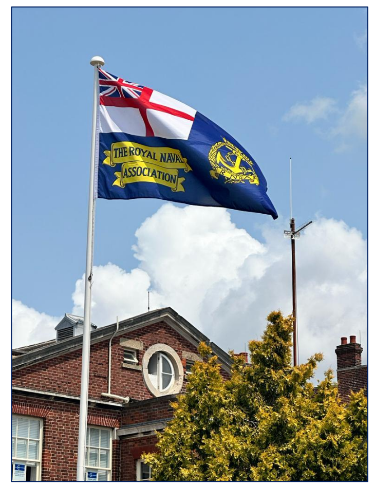
Central Office flying the RNA House Flag

Since Covid, we've done so much more in the welfare/wellbeing space with our veterans, and having an RNA Lottery will allow us to do even more. Thank you and good luck!