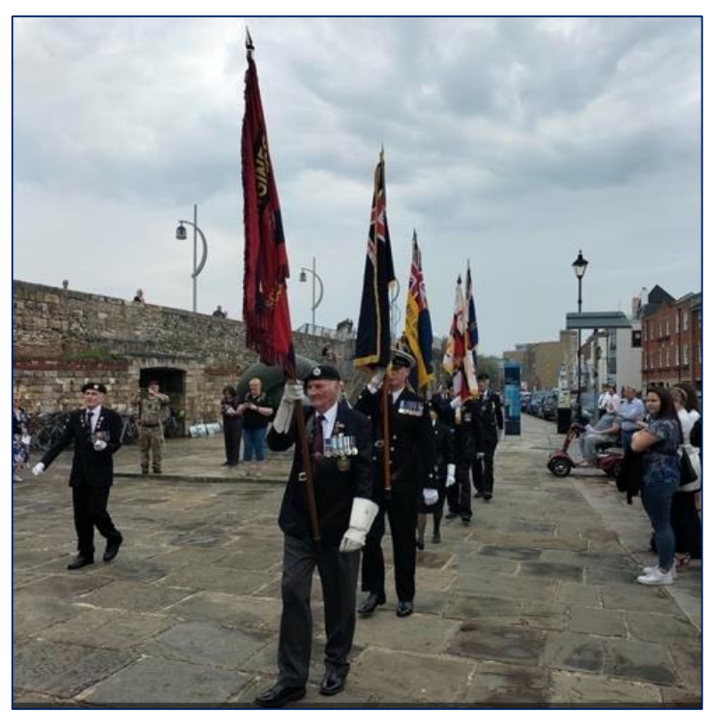
Branch fielded lots of positive feedback and some potential new joiners – all in all a good public relations event for the Branch.

Name the Teddy and Tot time went down well, especially with shipmates from Aldershot Branch who showed up!